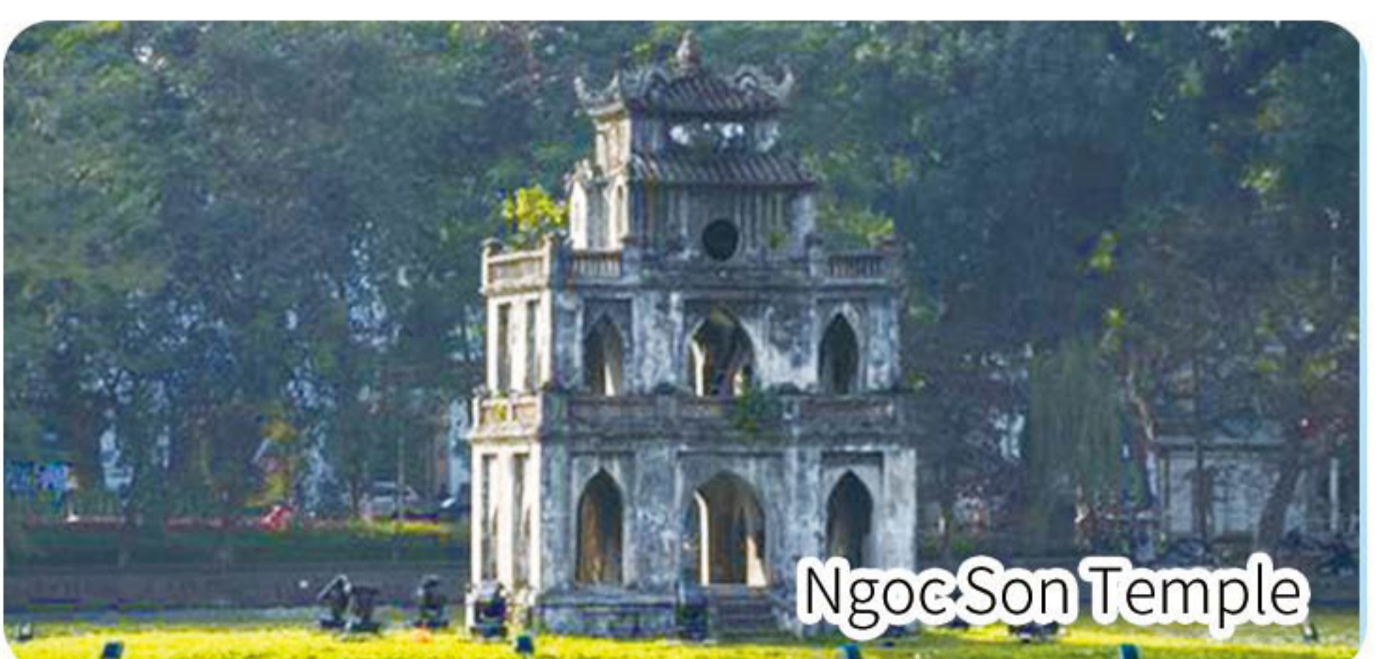
Ngoc Son Temple