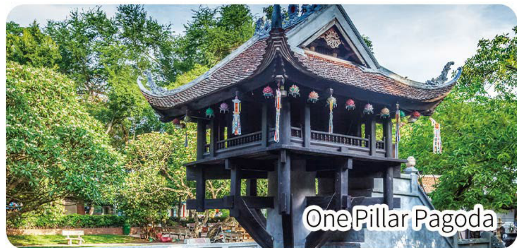
One Pillar Pagoda

Hotel: Muong Thanh Luxury Ha Long Centre or similar