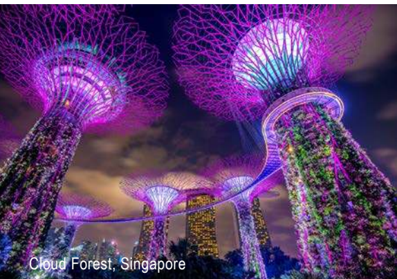
Cloud Forest, Singapore