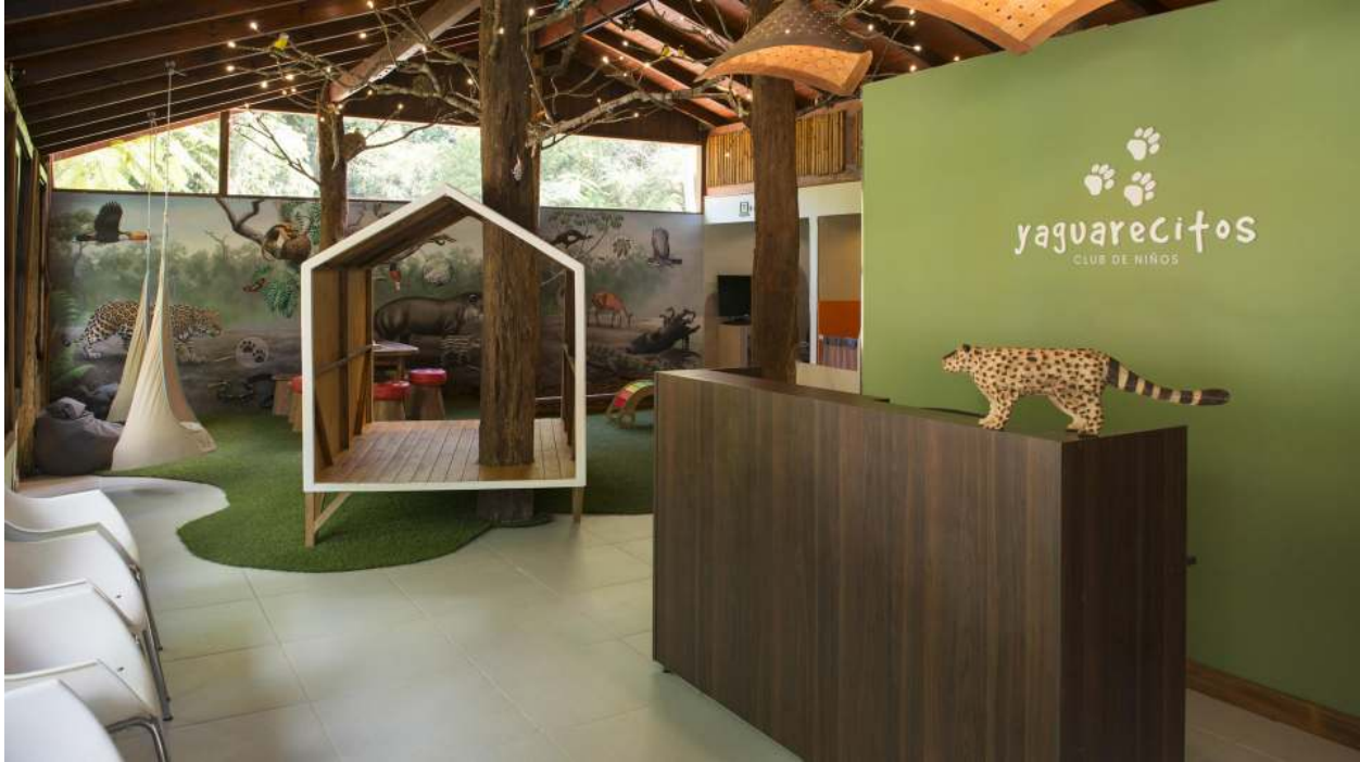
Yaguarecitos Kids Club