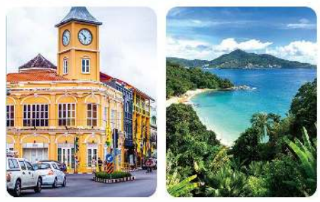
Hotel: Phket Graceland Resort & Spa or similar