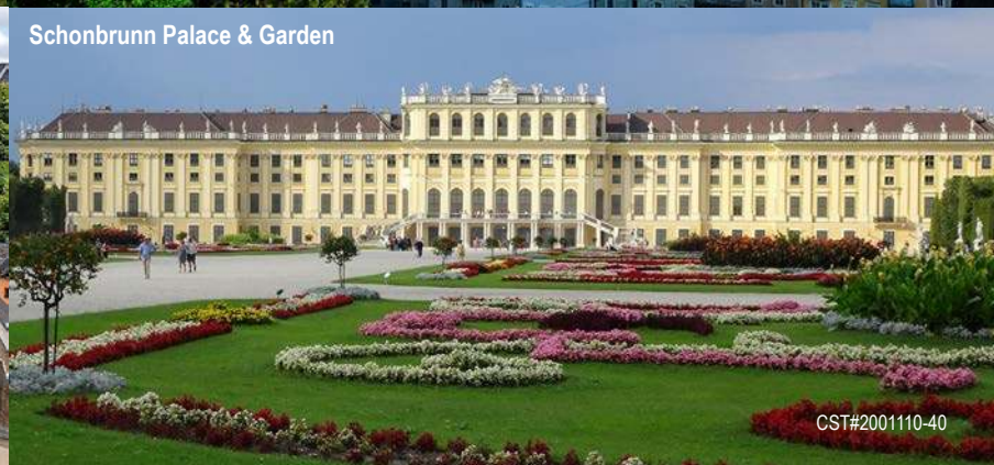
Schonbrunn Palace & Garden