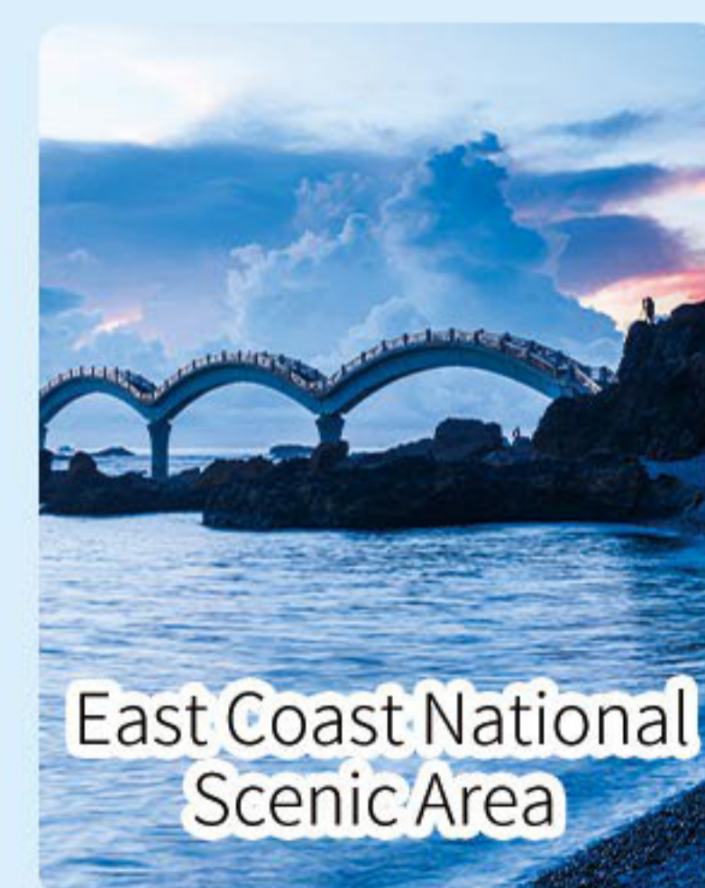
East Coast National Scenic Area

Arrange for English/Chinese (Mandarin) tour guide