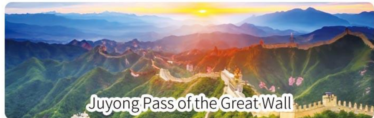
Juyong Pass of the Great Wall