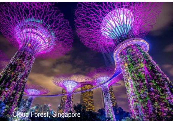
Cloud Forest, Singapore