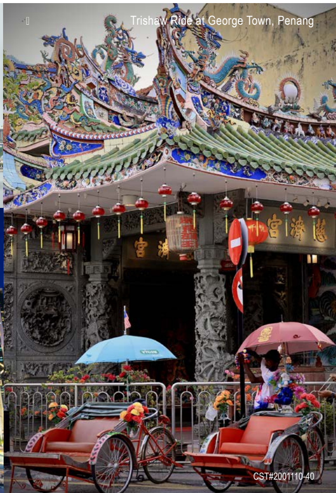
Trishaw Ride at George Town, Penang