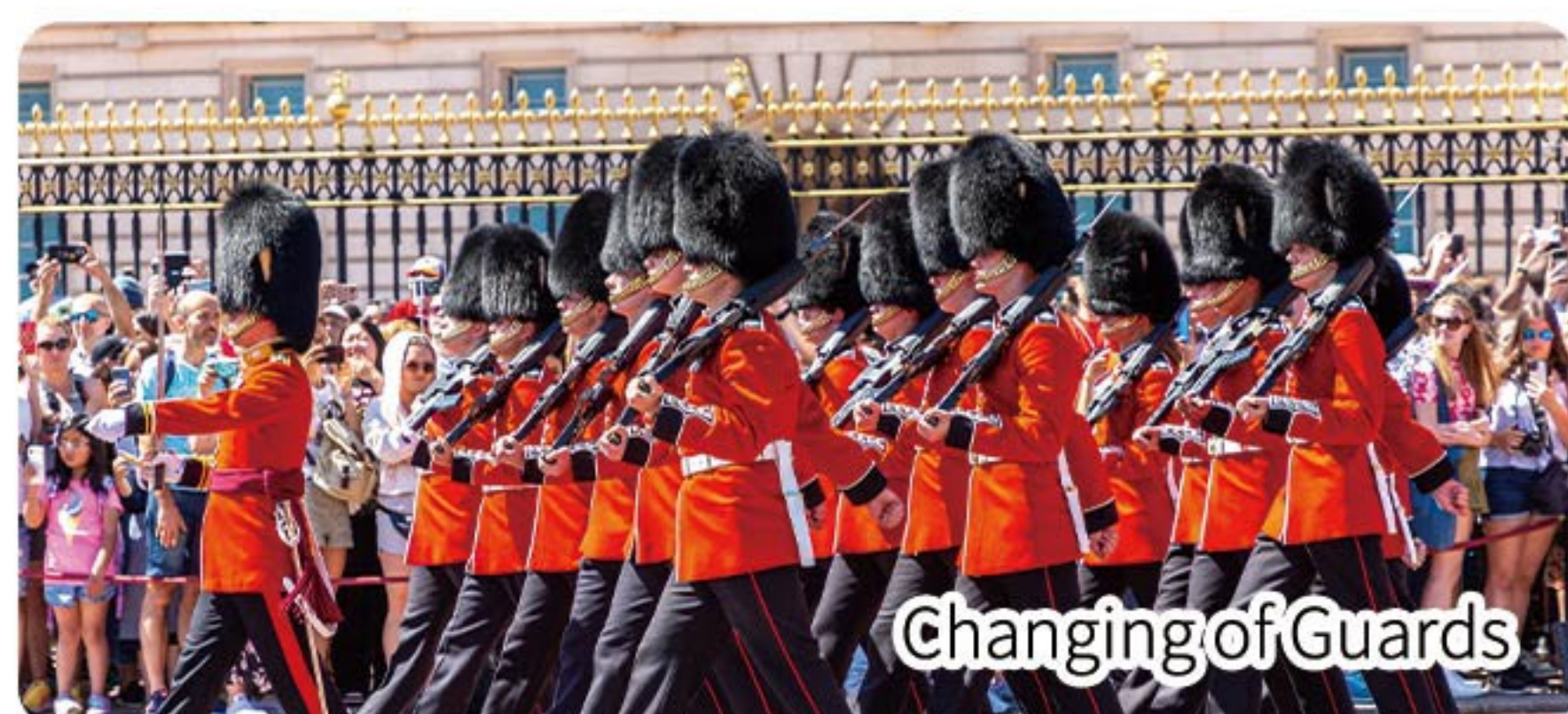
Changing of Guards