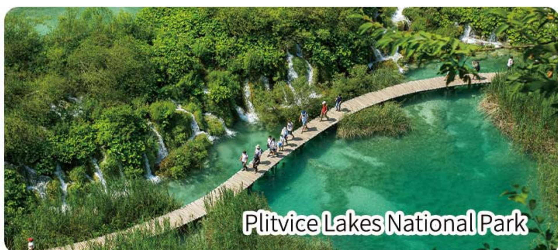
Plitvice Lakes National Park

Hotel: International Hotel or similar B/L