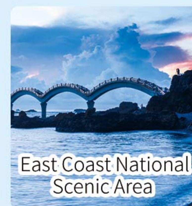
East Coast National Scenic Area

Arrange for English/Chinese (Mandarin) tour guide