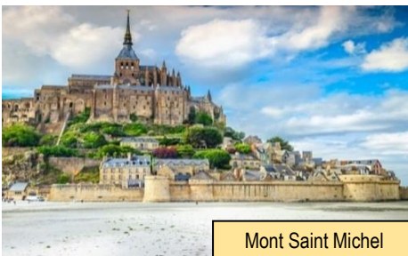
Mont Saint Michel

Accommodation : Mercure Hotel or similar