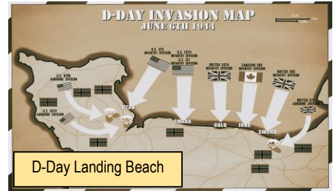
D-Day Landing Beach