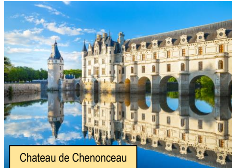
Chateau de Chenonceau

Accommodation : Mercure Hotel or similar